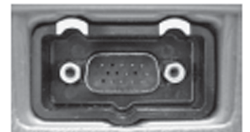
Booth socket The cable-to-booth connection fits only one way. Do not force.