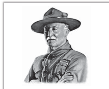
Sir Robert Baden Powell

Ever since I've been your Chief Elections Officer, that's been our motto. We test our knowledge, our procedures, our equipment ...we practice, practice, practice...we develop training procedures and instructional materials ...and we rehearse every aspect of the election. That's why we enjoy a national reputation for conducting accurate elections and for issuing timely results.